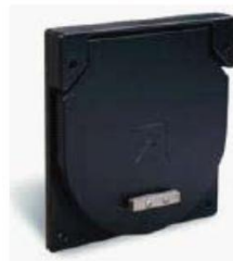
Rowat RLK Rowat RFK Rowat RPK