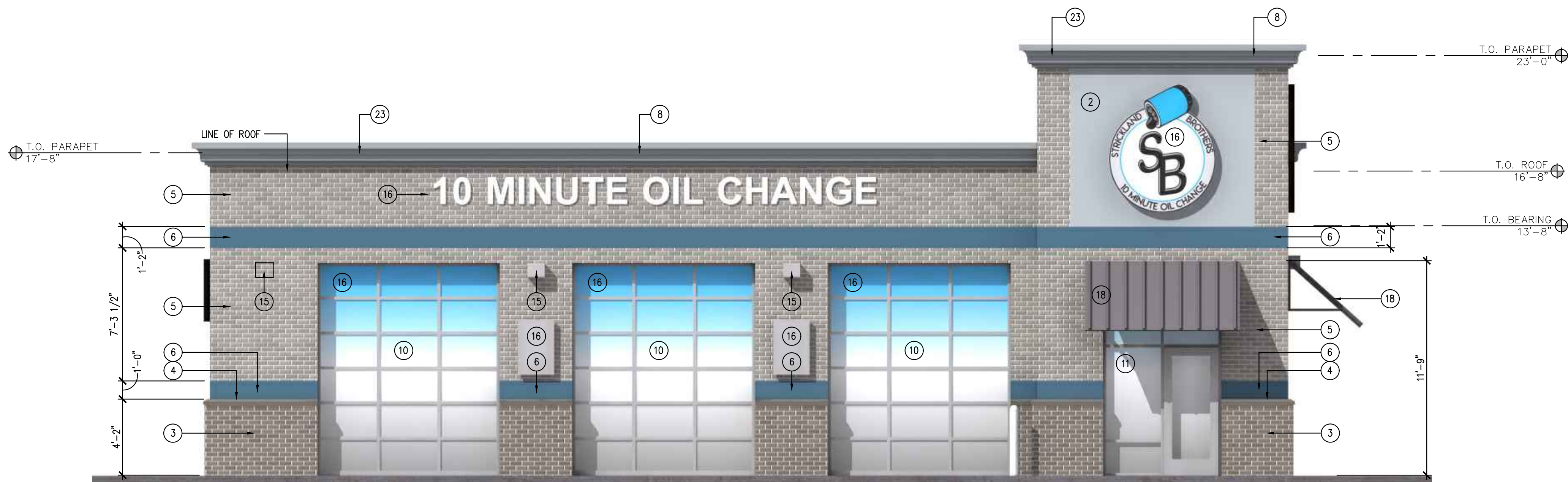
2 EAST ELEVATION SCALE: 1/4" = 1'-0"